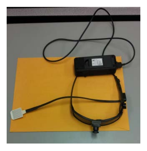
Fig. 2. Brainport tongue stimulation

signal is obtained from a camera mounted in the center of the glasses and processed on-board in the black handheld device. The depth view is obtained from a simulated Microsoft Kinect. The simulated motion map is derived from the depth view using known intrinsic and extrinsic parameters of Microsoft Kinect, i.e. calculating the disparity value of each pixel. Then two views are generated by shifting all of the pixel locations to the left (and right) by its disparity divided by 2. These two views are displayed consecutively such that you can see objects nearer to you shifting more than objects furthest from you. This map is also an alternative data that we can feed into the tongue stimulating array in an attempt to capture object's presence by virtually "moving" it. The IR sensors (on arms and legs) will be sensing the virtual environment and trigger the corresponding vibrators based on the scene [18]. This method of "display" is called vibrotactile [5]. Figure 3 shows a prototype designed by our lab [18], where the frequency of vibration corresponds to the measured distance (i.e. obstacle that is very closer to the user will have stronger/faster vibration).