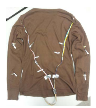
Fig. 3. Vibrotactile Prototype

algorithms using the Kinect [19]. Similarly, the laser range and sonar sensors will be used as a comparison to IR sensor, studying its tradeoff in range and field of view.